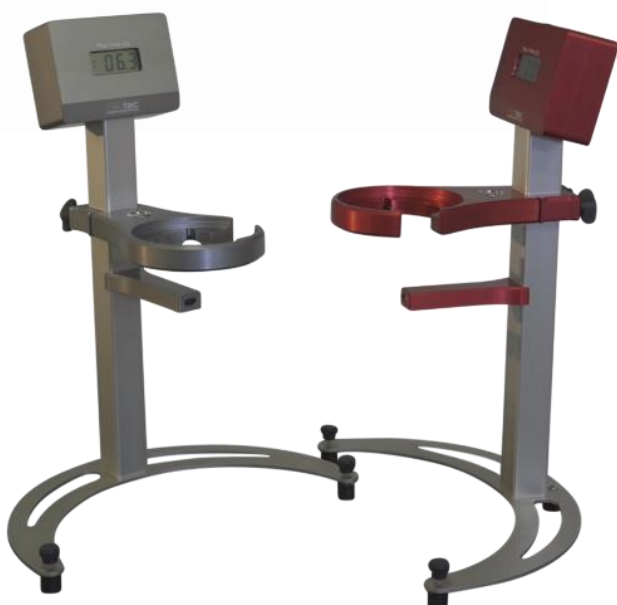
Figure 1. Flow Timer in different colours